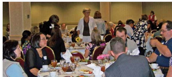
Hard to find a seat in this crowd.