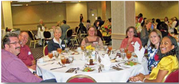
So glad to see the camera approaching.