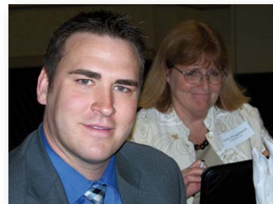
Aerotek meets Oneok.