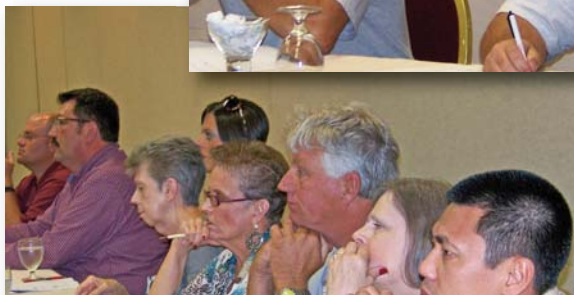
Supervisors pay close attention to what is legal.