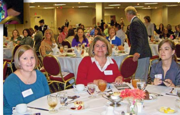
Gather round - the program's about to start!