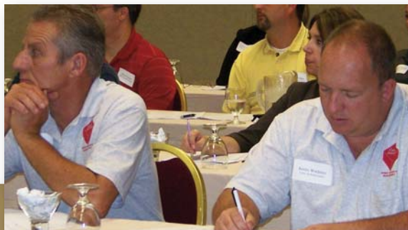
Case & Associates managers take in critical information.