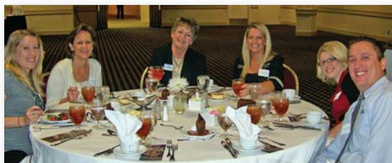
Love these get together!