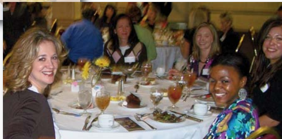
Great to see ORU student chapter members.