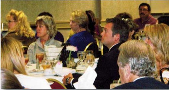
We learn how costly manager mistakes can be.