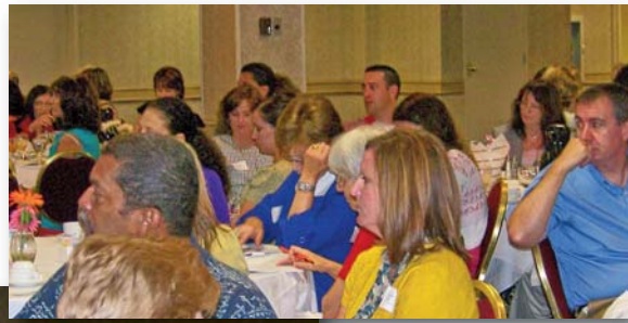
Pondering simple ways to avoid lawsuits.