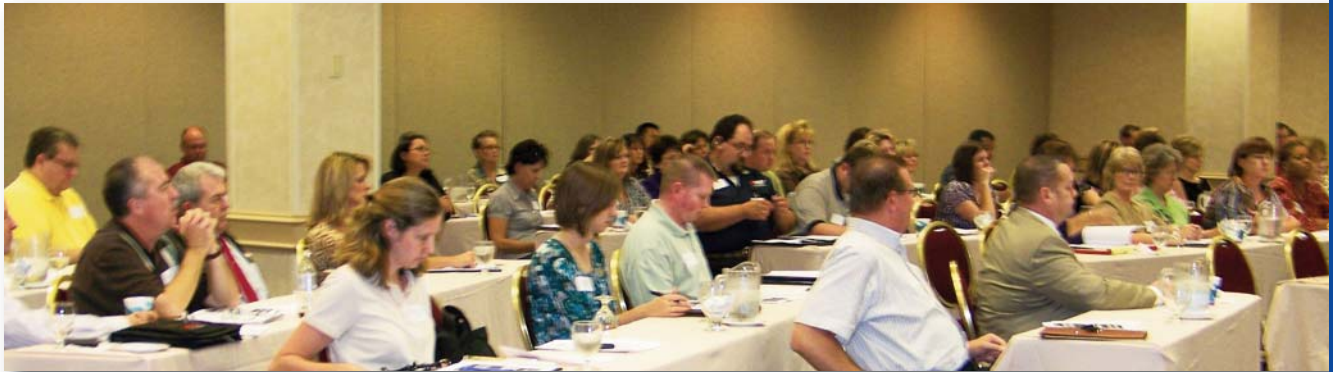
A full house for the annual Managers & Supervisors workshop.