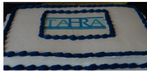
TAHRA Cake for ALL!