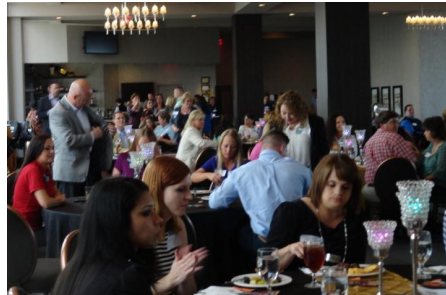
TAHRA Members and Guests having a great time!