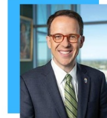
G.T. BYNUM Mayor, City of Tulsa